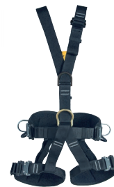
TECHNIC steel speed