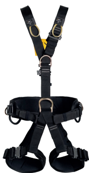
TECHNIC ANSI SPEED