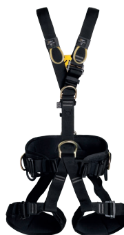
TECHNIC ANSI STANDARD