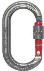
KL100SG1 Single Pack