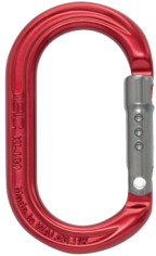
KL100ST1 Single Pack