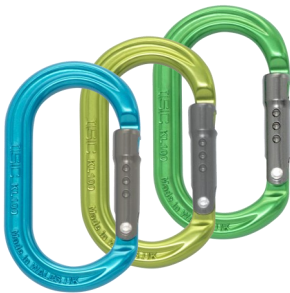
KL100ST-3PK1 3 Pack